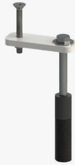
ADA Fixing Kit

For access to CADs, Revit drawings and more visit our Partner Login page on our website and become an Aqua Creek partner.